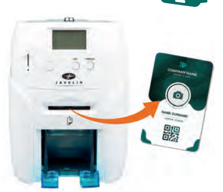
Tap the printer Icon and your card will be printed wirelessly ready to issue.